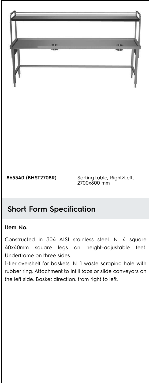
865340 (BHST2708R) Sorting table, Right>Left, 2700x800 mm